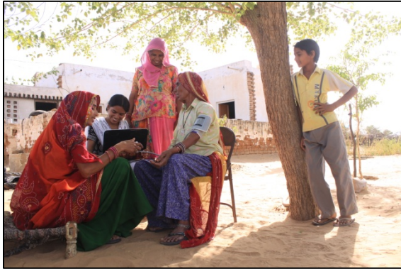
Arogya Ghar kiosk-based clinic system (above and below)