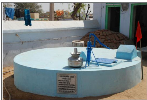
AG House Tank, Griha Tank

Part of the harvested rooftop rainwater is stored in the House Tank, or Griha Tank , a reservoir attached to a house for the exclusive use of the home owner. Typically, the Griha Tank stores enough water to meet the drinking water needs of the family for a year.