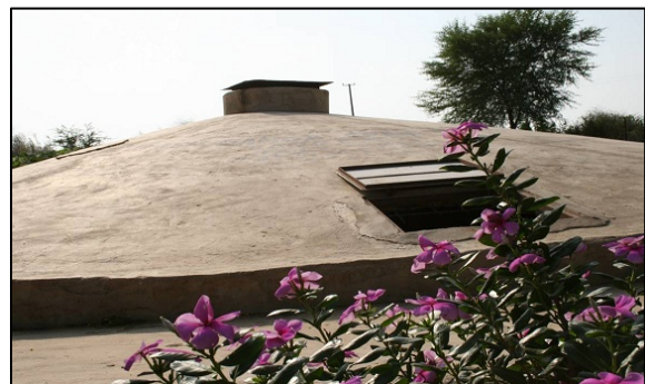
AG Community Tank, Gram Tank

Funded through a $200,000 World Bank Development Marketplace grant in 2006 and matching funds from the Rajasthan Association of North America, this network of reservoirs is designed to provide 10 – 12 liters of water daily per person to an entire village for a year; to-date, it has helped 10,000 villagers gain access to clean water.